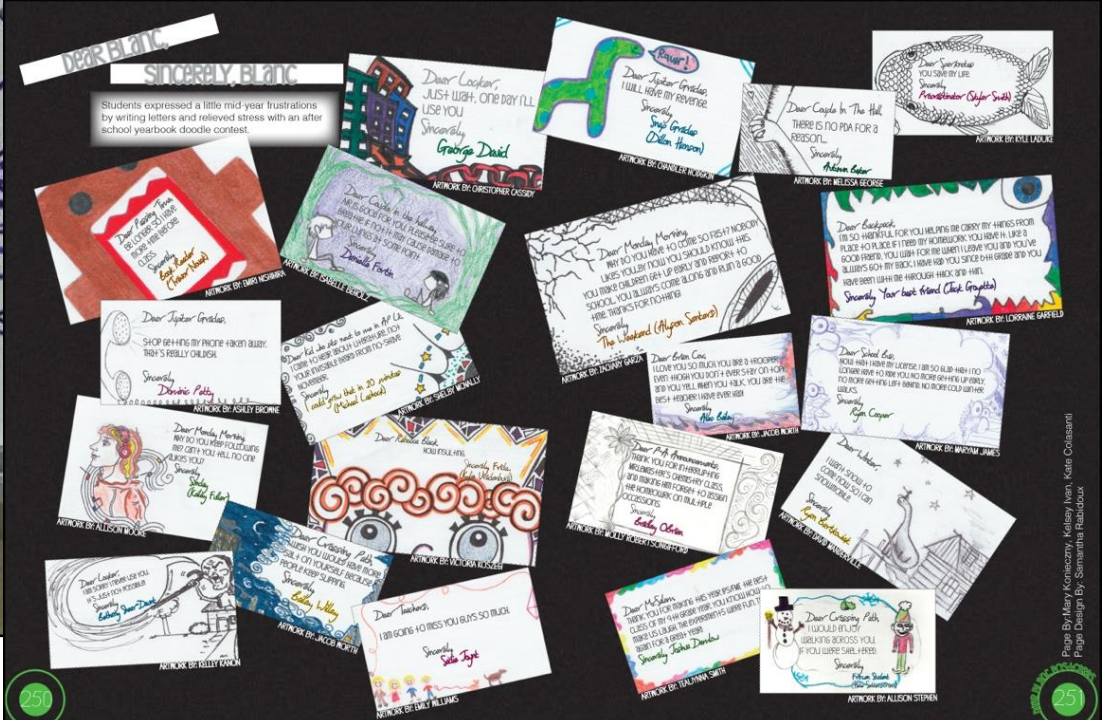
Students expressed a little mid-year frustrations by writing letters and relieved stress with an after school yearbook doodle contest.

WIN GIFT CARDS + YOUR chance to be featured in the YRBK + EXCLUSIVE SNEAK PEAK!